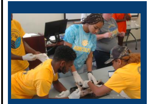
Summer BAYOU Program, Pg. 3