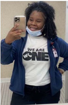
Currently works for Acadian Ambulance Services

Jaguar Scholars is a Department of Labor-funded program that launched here at Southern University at Shreveport. The Jaguar Scholars program was a Job Corp pilot program that was implemented on campus in June 2020. With our community in mind, the program provided youth and young adults options relating to education. The Jaguar Scholars program was intentional in providing youth and young adults the opportunity to attain a certification in twelve months or less in a high-demand field. The Jaguar Scholars program offered a plethora of certifications ranging from computer networking to phlebotomy. In addition, the Jaguar Scholars program was a pathway for students who attended the HiSET program housed at the Metro campus location. Once students completed their HiSET exams, they were given the option to apply for the Jaguar Scholars program to pursue a certification in a desired field.