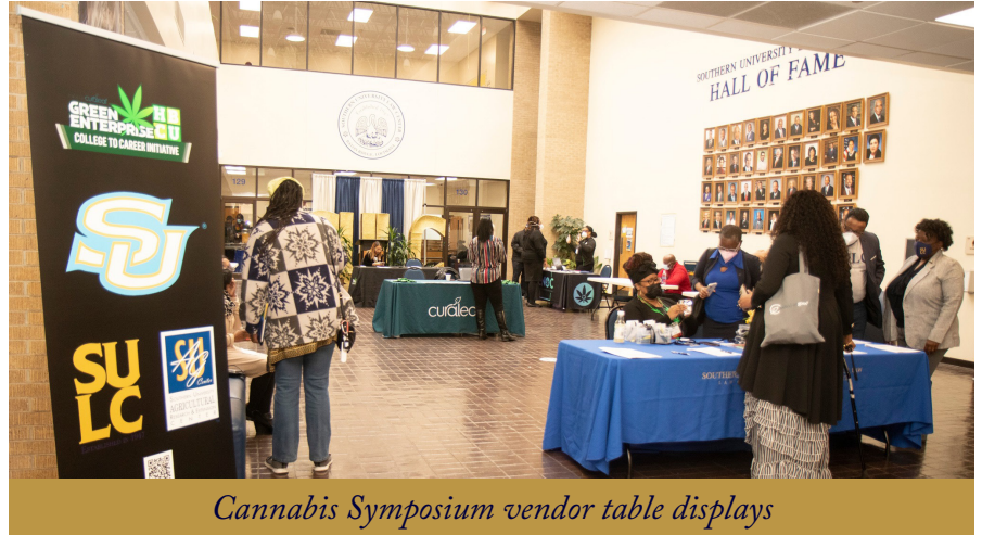
Cannabis Symposium vendor table displays

The event also featured a Hemp Growing 101 session which provided participants with hands-on training.