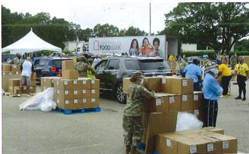
SU faculty, staff and students worked as volunteers during Greater Baton Rouge Food Bank distribution of 1,500 boxes of food.

These increases are tied to increased movement as more businesses resume operations with inconsistent adherence by the public to recommended precautions like social distancing and masking. According to LDH, there have been 19 outbreaks associated with bars across the state.