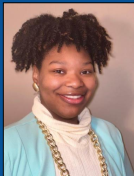
College of Ag Alum Aspires to become a Public Health Veterinarian, Pg. 4

A PUBLICATION OF THE SOUTHERN UNIVERSITY AGRICULTURAL RESEARCH AND EXTENSION CENTER, VOL. 21, No. 9 | SEPTEMBER 2022