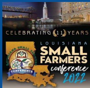
LA Living Legends Honored during Small Farmers Conference, Pg. 5

A PUBLICATION OF THE SOUTHERN UNIVERSITY AGRICULTURAL RESEARCH AND EXTENSION CENTER, VOL. 21, No. 10 | OCTOBER 2022